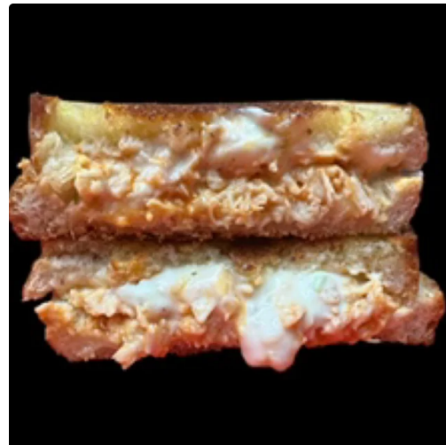
BUFFALO CHICKEN MELT

Tender pulled chicken, house Buffalo, sliced Cabot cheddar and homemade jalapeno ranch & our white cheese sauce on golden grilled sourdough.