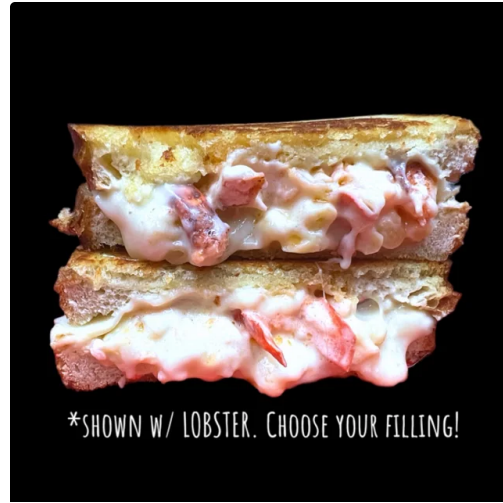
MAC & CHEESE MELT